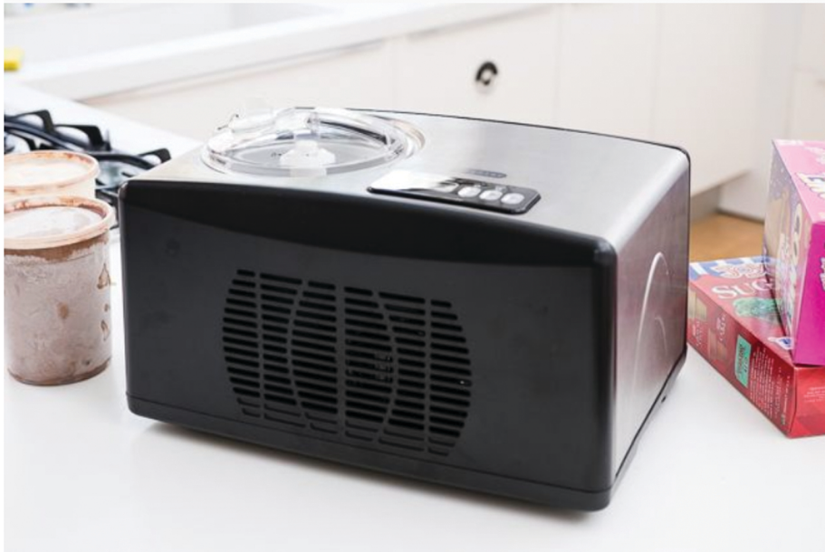
The Whynter ICM-15LS.